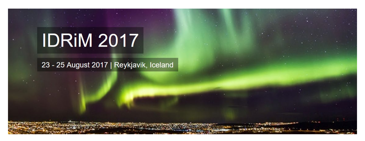
IDRiM 2017 Conference

Dimensions of Disaster Risk Reduction and Societal Resilience in a Complex World